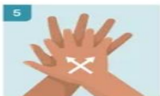
SCRUB BETWEEN YOUR FINGERS