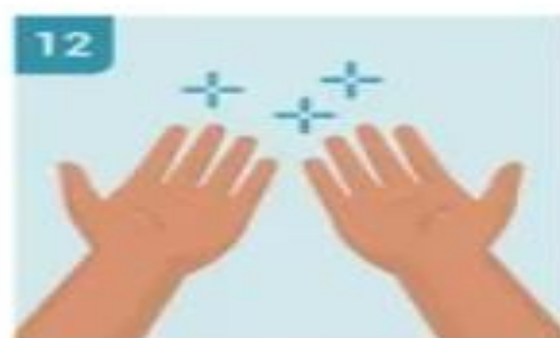
YOUR HANDS ARE CLEAN