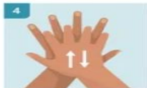
LATHER THE BACKS OF YOUR HANDS