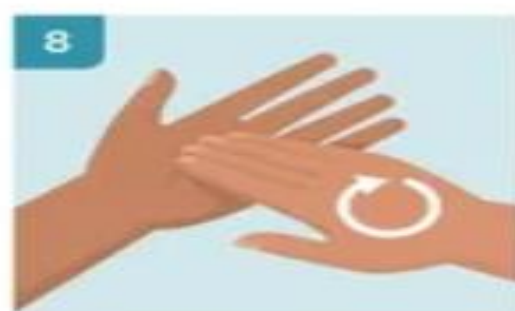
WASH FINGERNAILS AND FINGERTIPS